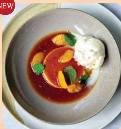
MANDARIN ORANGE CRÈME CARAMEL RM24