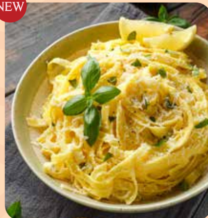
CITRUS PESTO PASTA (v) RM30