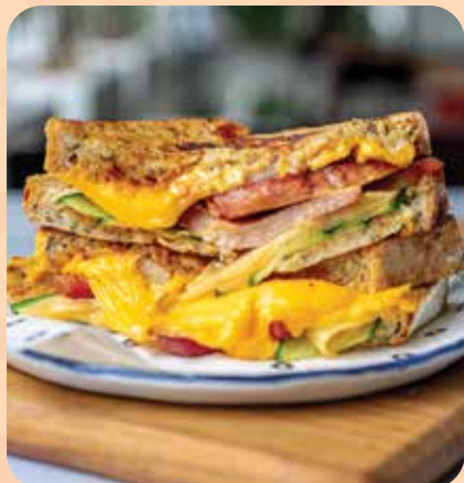
DONALD'S CHEESE TOASTIE RM28

AVAILABLE FROM MON, 9 TH JAN TO SUN, 5 TH FEB