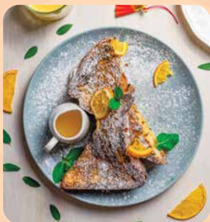
ORANGE MARMALADE FRENCH TOAST RM24